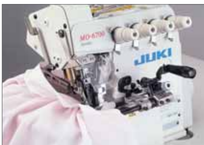
● For gathering MO-6714S-BE6-327/S162 (S162: Swing-type gathering device)