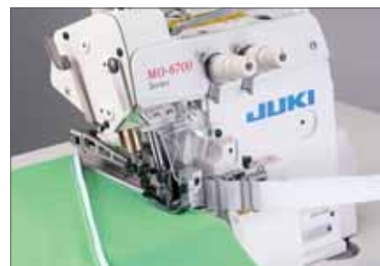
● For rolling-in tape MO-6745S-ED4-360/N077 (N077: Clean finish top and bottom)