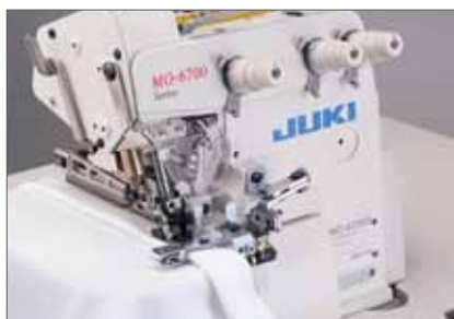
● Blind hemming MO-6705S-0E4-41H/L121 (L121: Blind stitch hemming attachment)

Diversified subclass machines are available. The selection of a machine that best matches the processes in concern are permitted.