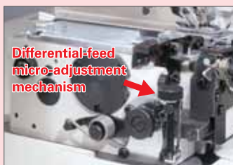
Differential-feed micro-adjustment mechanism

The machine incorporates various mechanisms as standard, such as a differential-feed micro-adjustment mechanism and an external adjustment mechanism for adjusting the feed dog inclination as well as increasing the differential feed ratio, which can be easily adjusted to finish seams that perfectly match the material to be used. Comfortable operation is all but guaranteed, by a wider area around the needle entry, the adoption as standard of a micro-lifter feature that offers improved responsiveness to materials and provides the operator with upgraded operability, and by the reduction of operating noise and vibration, which has been achieved by designing an optimally balanced machine.