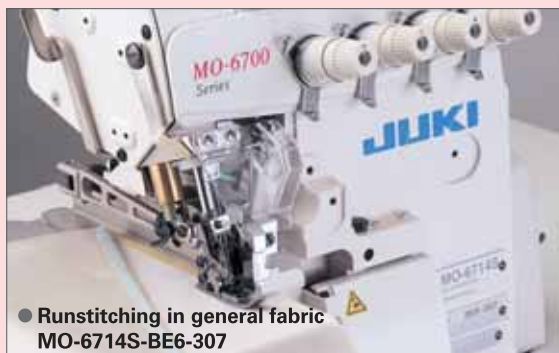
● Runstitching in general fabric MO-6714S-BE6-307

Since the machine comes with a needle-thread take-up mechanism as well as a looper thread take-up mechanism, to offer upgraded responsiveness from light- to heavy-weight materials with a lower applied tension, it achieves well-tensed soft-feeling seams that flexibly correspond to the elasticity of the material at the maximum sewing speed of 7,000sti/min.